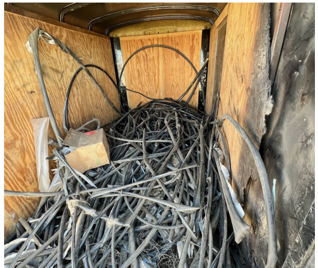
Left: Vandalism of wire conduit on utility pole. Top right: Underground wire vault broken into and vandalized. Bottom right: Trailer full of stolen wires.