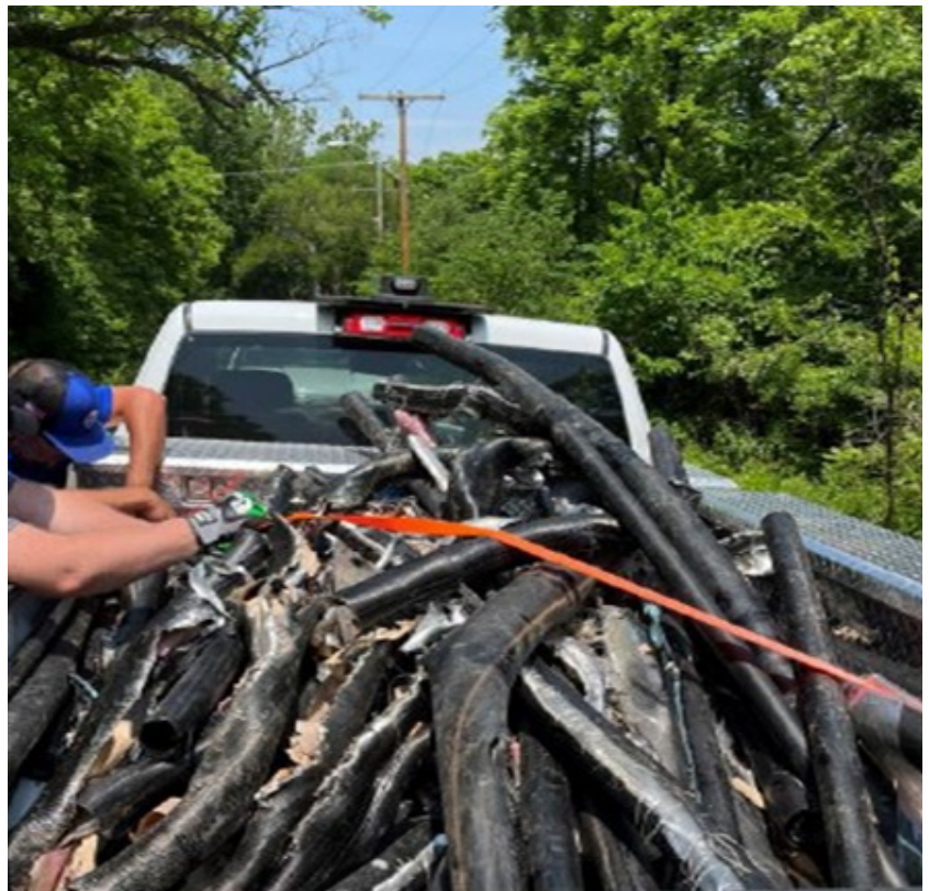
Left: Thief makes off on bike with severed wire and splicing box. Right: Truckload of stolen wires.