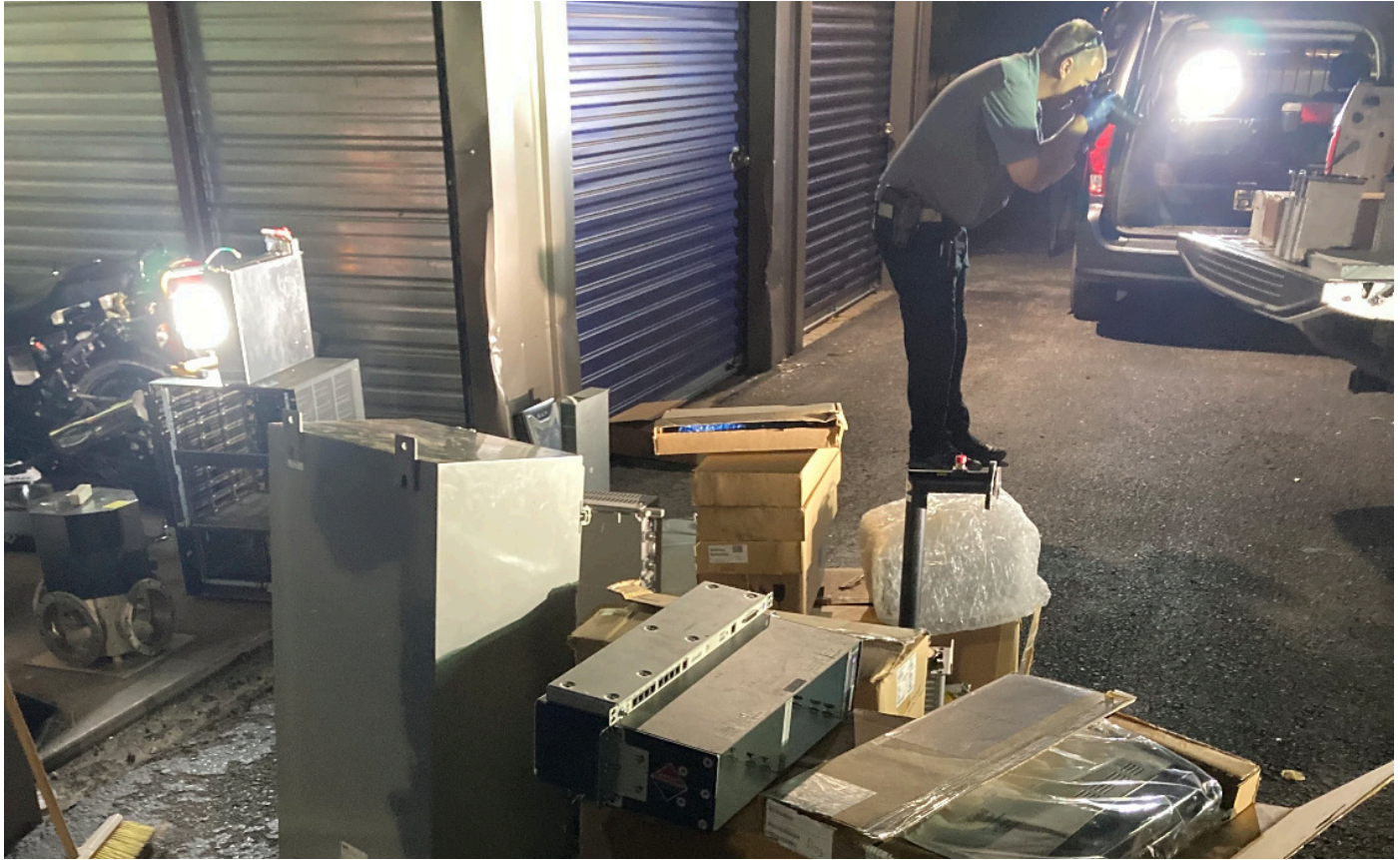
Stolen network equipment that has been recovered, but likely not reusable.

copper inside. That copper is then typically sold to scrap metal dealers, some of whom, in periods of high demand, are willing to accept the valuable commodity purportedly without knowing its origin.