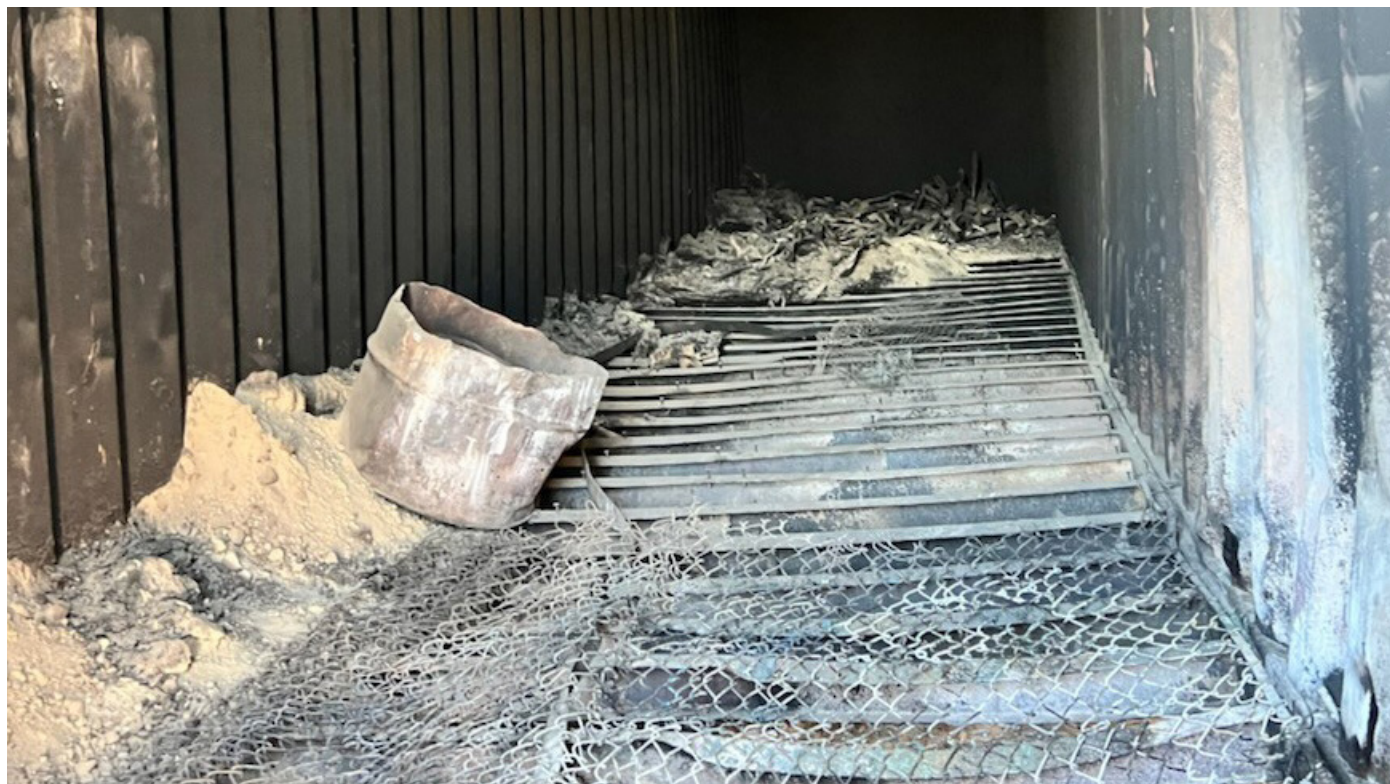
Thieves installed a shipping container underground which was then used to burn sheathing off wires.

All of these beneficial aspects of communications are threatened when vital portions of our critical infrastructure are dismantled by vandalism and theft.